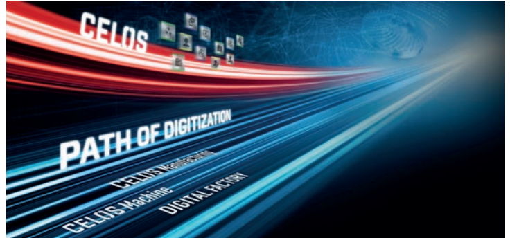
CELOS & DMG MORI POWERTOOLS: Your entry into digitization