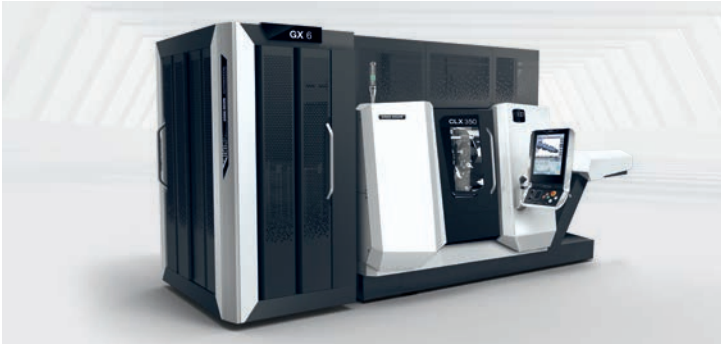
INTEGRATED AUTOMATION: CLX 350 with GX 6, NLX 2500 with Robot, CMX 1100 Vc with MATRIS and NHC 4000 with RPP 21