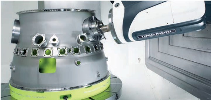
DMG MORI TECHNOLOGY EXCELLENCE CENTER: Aerospace and Automotive